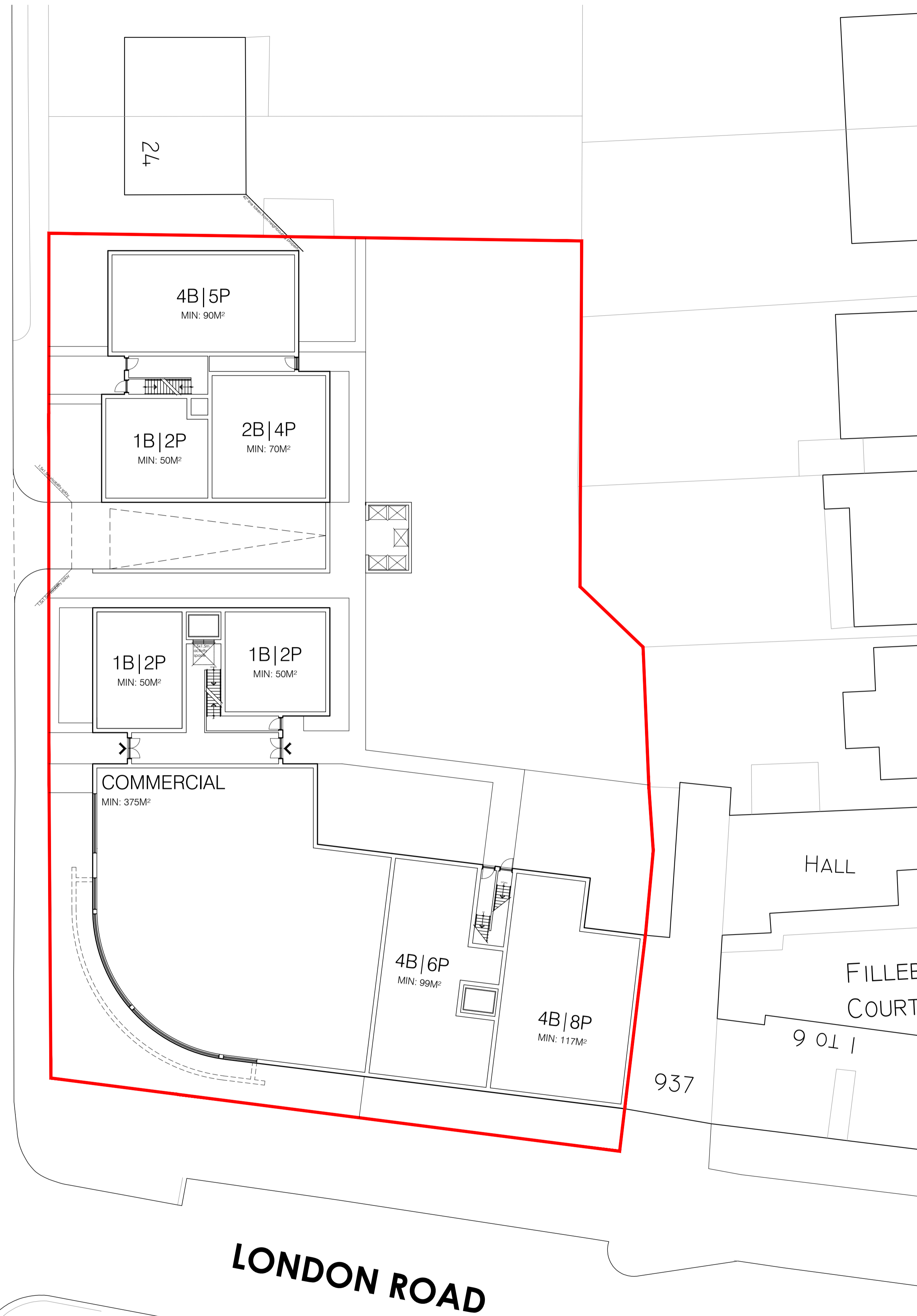
PROPOSED FIRST FLOOR BLOCK PLAN SCALE: 1:200@A1