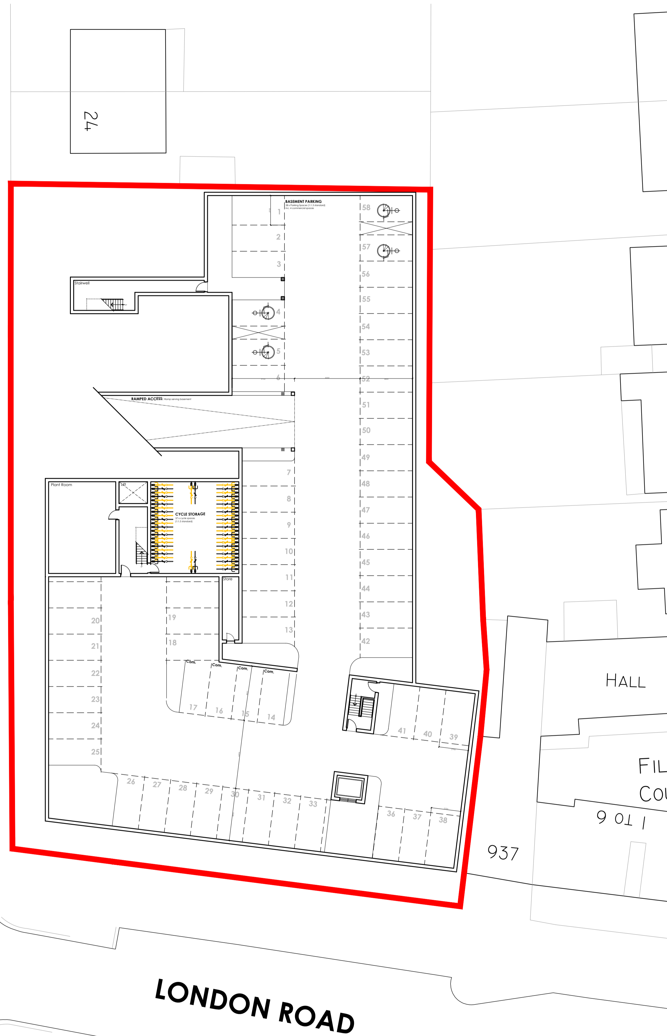
PROPOSED BASEMENT PLAN SCALE: 1:200@A1